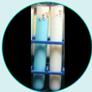
oxidized/reduced methylene blue